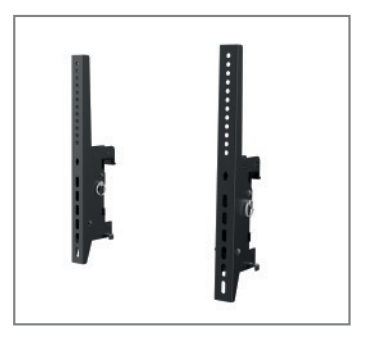
VESA-Arms, 0 - 20° tiltable